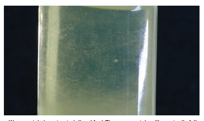
Wax crystals in untreated diesel fuel. The wax crystals will eventually fall out of solution and plug the fuel filter.