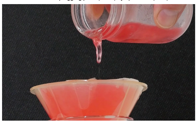
Wax formation in untreated diesel fuel resists pouring.

lowers the cold filter-plugging point (CFPP) by up to 40°F (22°C) in ULSD.