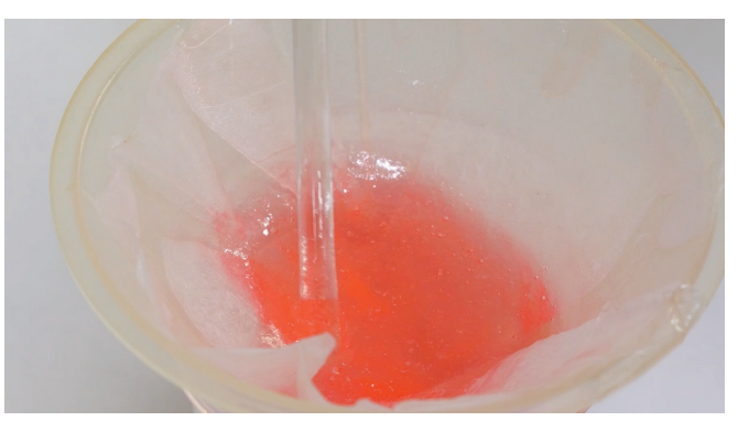
Wax formation in untreated diesel fuel plugs a coffee filter.