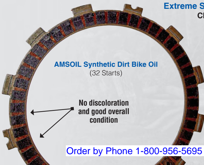
AMSOIL Synthetic Dirt Bike Oil (32 Starts)

No discoloration and good overall condition