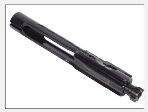
AMSOIL Synthetic Firearm Lubricant provided exceptional performance over rigorous range testing in multiple firearm applications.