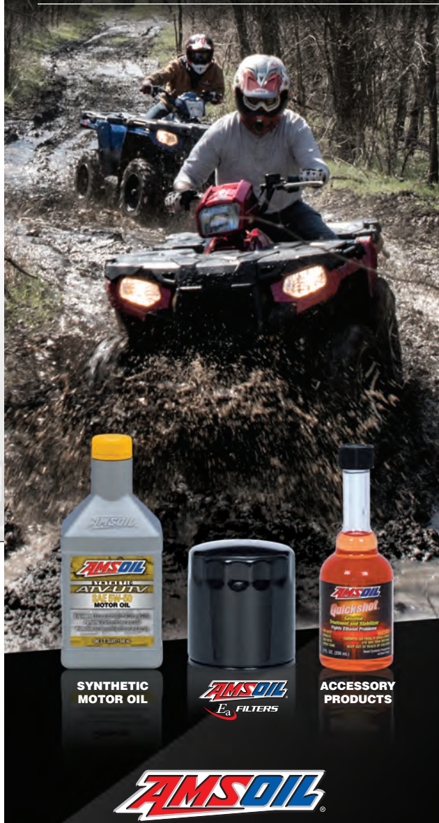
SYNTHETIC MOTOR OIL