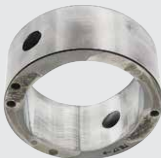
VANE PUMP CAM RING