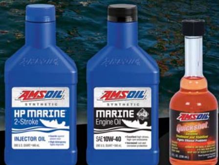
SYNTHETIC 2-STROKE OIL